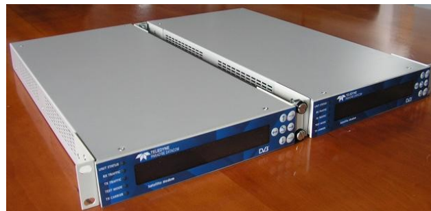
Side-by-side chassis, suitable for 19-inch rack mounting

PER v BER Note: A PER of 10-7 is equivalent to a BER of 6.6 x 10-11.